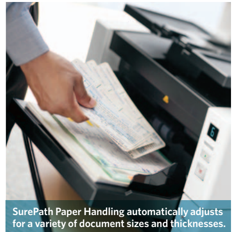
SurePath Paper Handling automatically adjusts for a variety of document sizes and thicknesses.

Optional A3 and A4 "tethered" flatbeds for added capability to scan odd-size, delicate or irreplaceable documents.